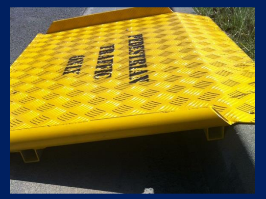
Manufactured for regulation gutter height